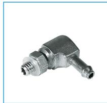
Angled Fittings - Barb Style Connection WVM3