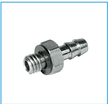
Straight Fittings - Barb Style Connection GVM3