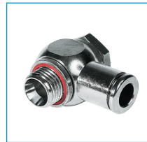
Angled Fittings - Quick Connect Style WVM5