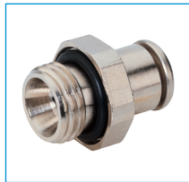
Straight Fittings - Quick Connect Style GVM5