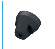
Centering cone DAL02350